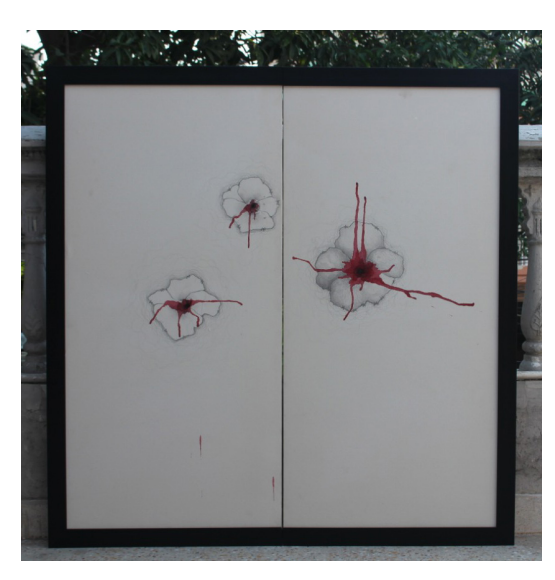
Artwork produced by young artists as part of the YAPP-supported project 'Invisible Resilience'. The artwork portrays the culture and beauty of the Hazara community in Quetta Baluchistan and the psychological effects of violence and discrimination committed against the Hazara in Pakistan (CDA)