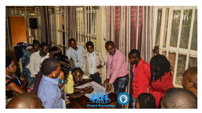
Peace exchanges organised by URU in CAR (left) and NPCYP in DRC (right), bringing together peace actors and young peacebuilders