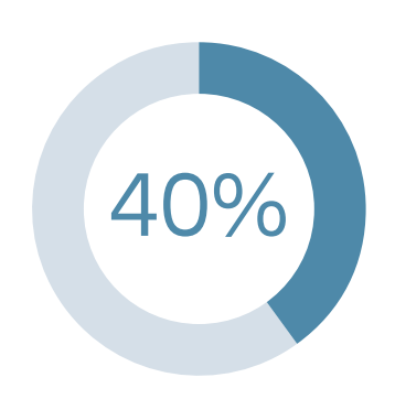
of respondents said that the quality of applications from local organizations is below expectations for the majority of applications

We can speculate some of the reasons for this. For example, in Section 1, we heard that the