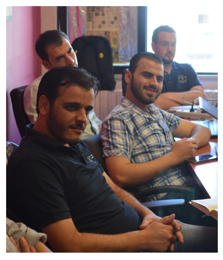
Syria Direct trainees attend a guest lecture. The Syria Direct training program, supported by the GPD Charitable Trust provides trainees with networking opportunities through guest lectures and opportunities to work with professional journalists.

"A major impediment to effective funding of local organizations is the paradigm that assumes funders/funding are "outside" and somehow separate from the system itself – this can be present even within a focus on supporting local organizations, as if the problem is simply where funding resources are directed (local vs. national) - but which still perpetuates an imagined flow of resources as solely (or primarily) from the outside in. These impediments will continue, until local communities are seen as at the center of a whole system, with distinctive roles for every level of the system, with healthy and connected relationships/ linkages between those levels, and with a flow (of resources, knowledge, learning, expertise, etc.) that also goes from the insideout instead of just the outside-in. This system necessitates a way of learning and a larger conversation as much about and for the nonlocals/funders, as it is for the locals."