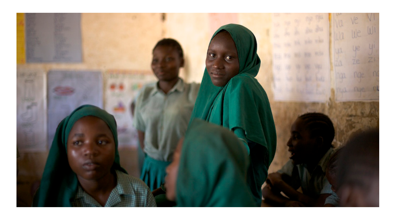
Students supported by the Coast Interfaith Council of Clerics, funded by the GHR Foundation, gather for a Peace Club meeting in eastern Kenya.

funding many organizations. We have been able to build a strong, long-term partnership that is flexible and responsive, and we offer our skills and experience to our partner on a regular basis without directing or dictating what they should do. We have worked to help them build their fiscal capacity for many years and have seen results; not quick results but significant results over time.