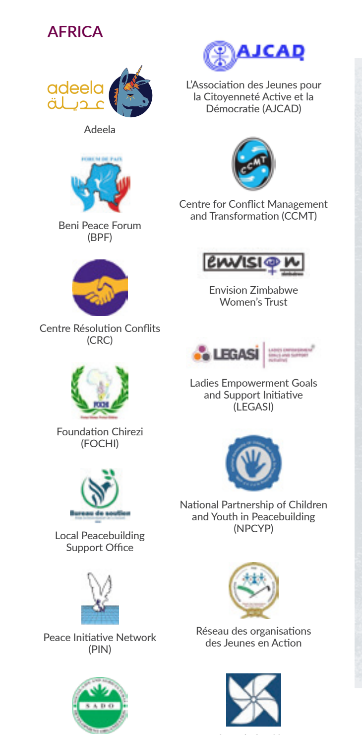
Social-Life and Agricultural Development Organization (SADO)

As always, we owe a debt of gratitude to our partners. They are working on the frontlines of conflict, at great personal risk, to stop violence and build peace. We continue to be inspired by their bravery and are honoured to be working with them.